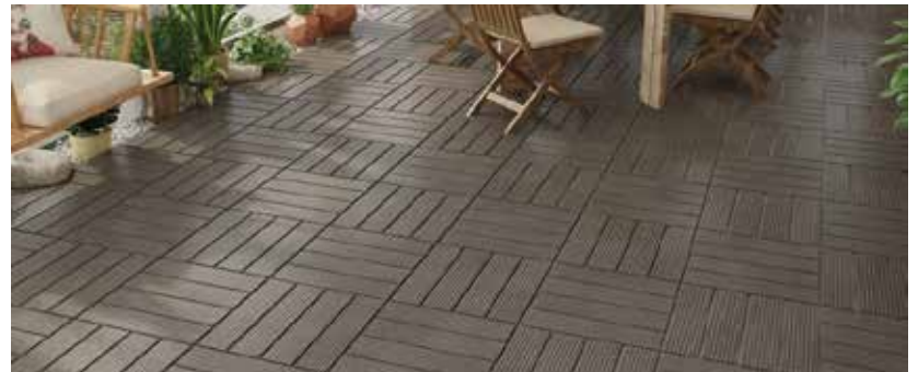
COMPOSITE DECK TILES IN CROSS HATCH PATTERN